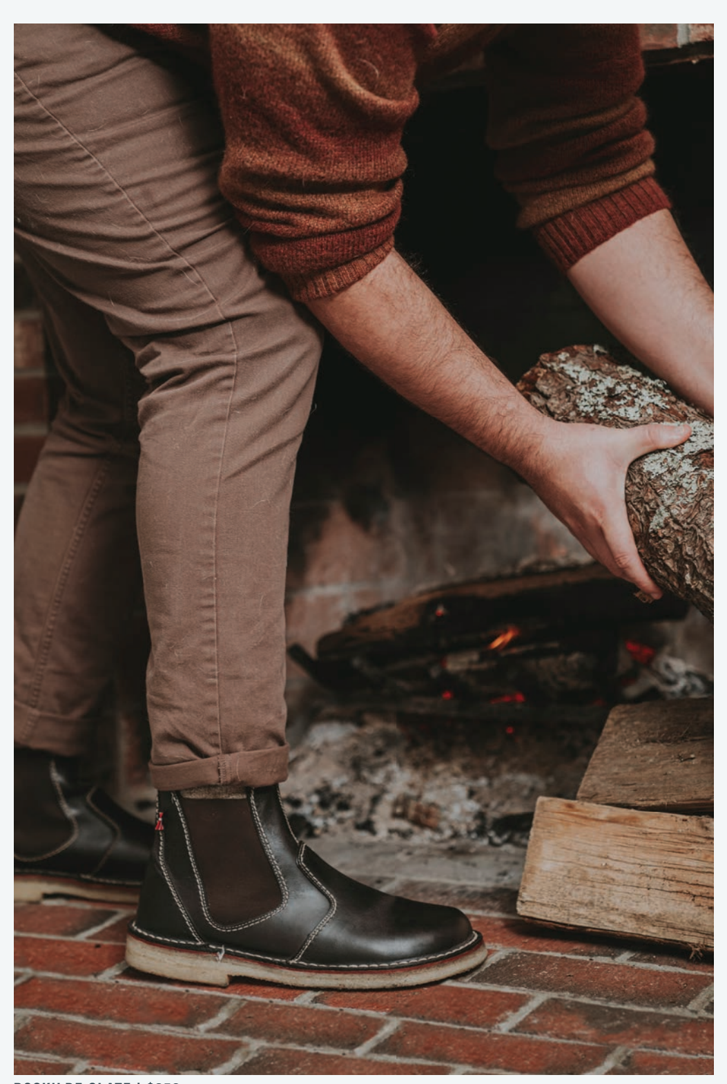
ROSKILDE SLATE | $258