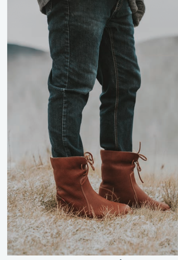
ÅRHUS NUT I $318

Cozy up in our classic wool-lined styles this winter. Keep warm in 100% premium European sheep wool and buttery-soft sustainable leather.